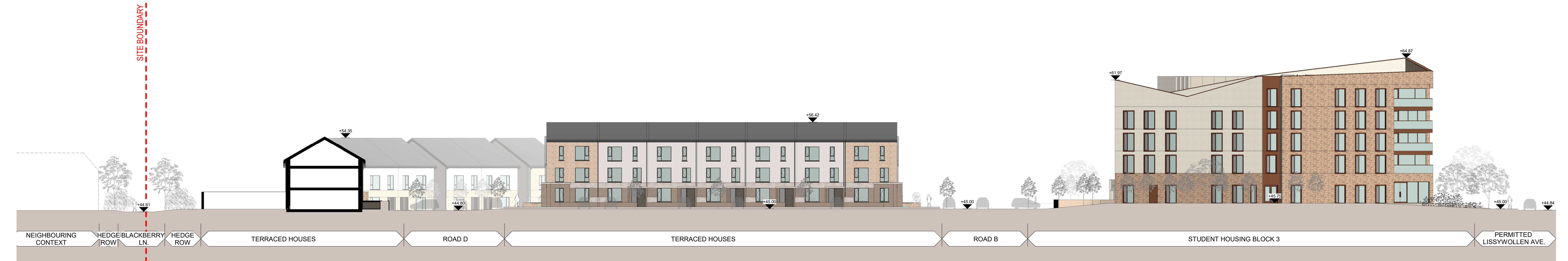
2 PROPOSED SITE SECTION B-B 1 : 200