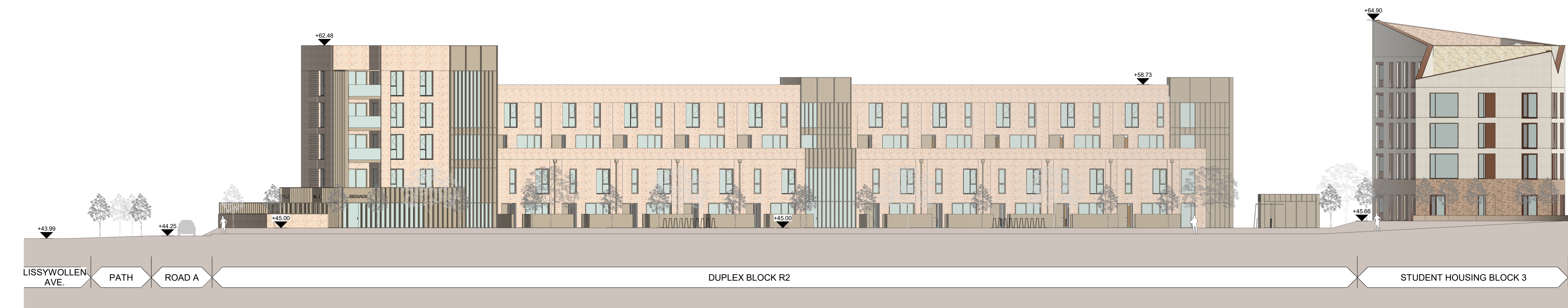
3 PROPOSED SITE SECTION C-C 1 : 200